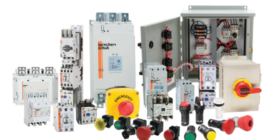
Industrial control products, contactors, disconnectors, circuit breakers and buttons.