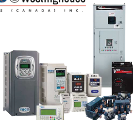
Motor speed variator (Drive).