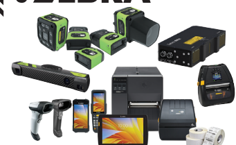
Mobile computers, printers, barcode scanners, 3D vision and scanners.