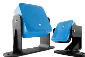
Inxpect safety radar 200 series sensors are IEC TS 61496-5 certified.