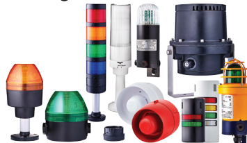
Light beacon and sound beacon.