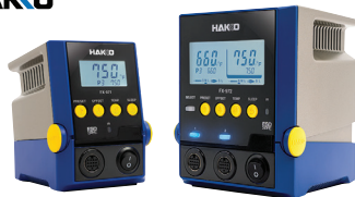
Tools for soldering and desoldering, fume extractor.