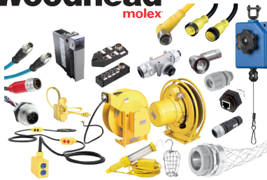
Industrial connection products.