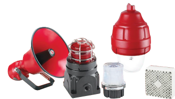
Light beacon and sound beacon.