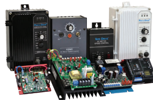
DC Variable Speed Drive.