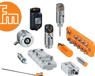
Automation products, sensors and vision.