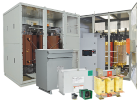
Industrial power and control transformers. Reactance.